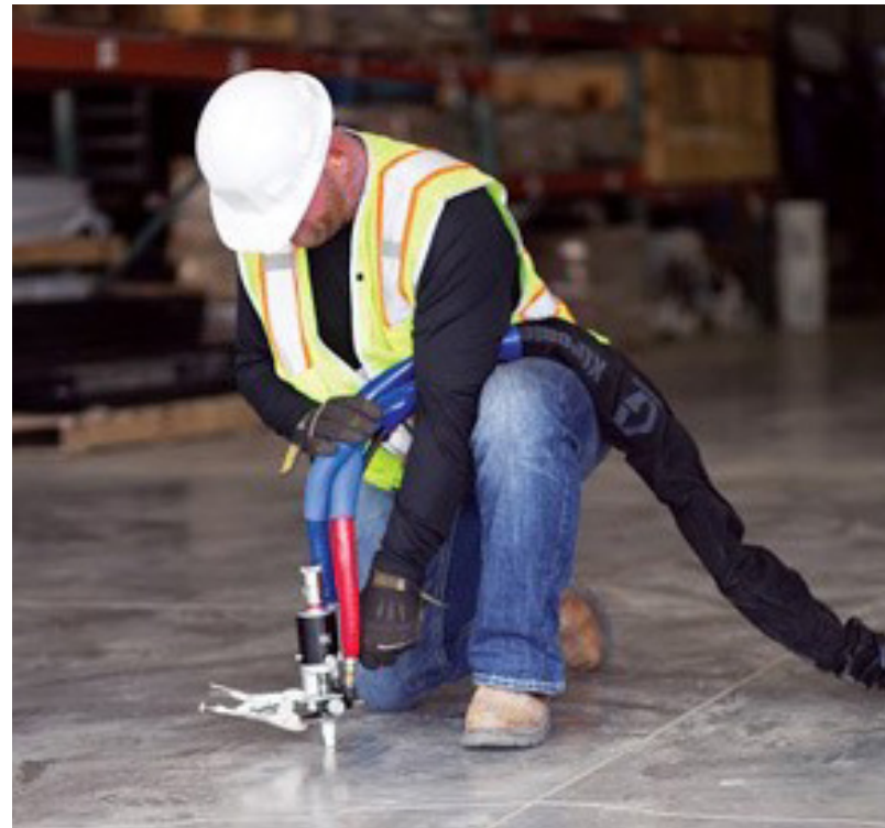
The PolyLift™ method utilizes high density polymers to raise slabs back to a desired level with precision lifting.

The installation of PolyLift™ can be completed in a matter of days, if not hours, without having to remove any interior finishes.